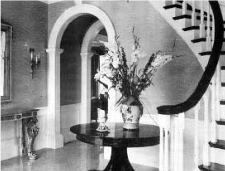
Figure 3. The bulk of the company's work is good quality painting and glazing. In this entry hall, a design was created by feathering a soft cream glaze over a regular taupe base. After the initial pattern was laid down with a soft, sweeping motion using the reverse side of the brush, areas were hand-highlighted to lend the effect of sunlight.

Figure 2. The oriental feel of this piece was created with a "Japaning" technique (using a dark-colored, short-oil varnish to prove a hard, glossy surface). The doors are a combination of stencils that were designed, cut, and executed by one of Perry's craftsmen, while the flowers' colors and deep dimension was created by another. At this point the center panel was at least two days from completion, with each successive day's painting adding more vibrance and depth to the piece.