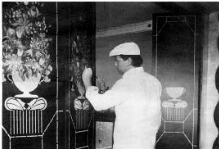
Figure 2. The oriental feel of this piece was created with a "Japaning" technique (using a dark-colored, short-oil varnish to prove a hard, glossy surface). The doors are a combination of stencils that were designed, cut, and executed by one of Perry's craftsmen, while the flowers' colors and deep dimension was created by another. At this point the center panel was at least two days from completion, with each successive day's painting adding more vibrance and depth to the piece.

Figure 3. The bulk of the company's work is good quality painting and glazing. In this entry hall, a design was created by feathering a soft cream glaze over a regular taupe base. After the initial pattern was laid down with a soft, sweeping motion using the reverse side of the brush, areas were hand-highlighted to lend the effect of sunlight.