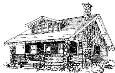
BUNGALOW (Vernacular) 1905-1925