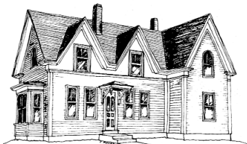
GOthic REVIVAL (Vernacular) 1840-1880