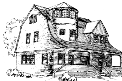
SHINGLE STYLE (Vernacular) 1875-1915