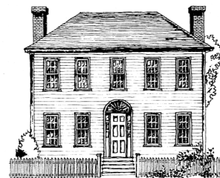
FEDERAL (Vernacular) 1790-1830