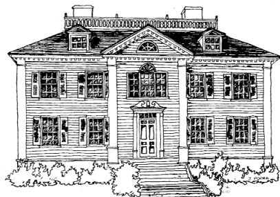
GEORGIAN (High Style) 1725-1810