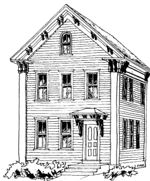
ITALIANATE (Vernacular) 1865-1895