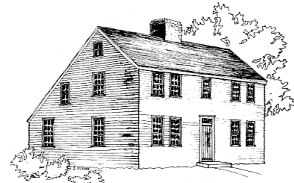
17TH CENTURY SALTBOX 1600's-1776