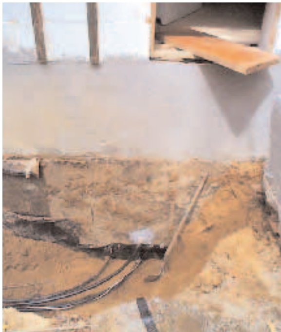
Figure 5. Water lines, drilled through the wall at a later date, are sealed with two-component urethane adhesive sealant, which cures to form a tough, elastic plug.

To complete the system, I installed Sure-Drain, a flexible plastic dimple sheet with an attached ground-filter fabric. Sure-Drain forms the primary water barrier by directing ground water down the wall to the Form-a-Drain, and protects the membrane from impact during