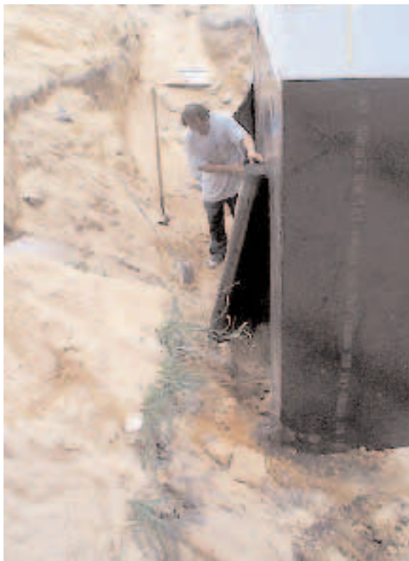
Figure 6. To direct ground water to the perimeter drain and protect the membrane from impact during backfill, fabric-filtered drainage mat is applied over the membrane.