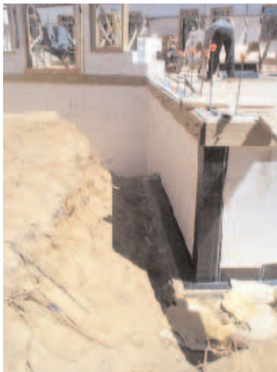
Figure 2. Twelve-inch-wide membrane strips reinforce vulnerable corner transitions and ensure a good bond over the cant strip.

According to the manufacturer, the membrane can be applied to fresh, clean rigid foam without priming, unlike concrete, which must always be primed first. But since the surface of foam blocks becomes dusty with prolonged exposure to sunlight, it seemed like a good idea to prep the ICFs to ensure a good bond. After a light wire-brushing to remove the dust, we used a roller to coat the foam and the exposed concrete of the footing with water-based Carlisle primer. On the first pass, we neglected to brush out the accumulated primer that dripped onto the footing from the roller. These spots didn't dry as quickly, and since the membrane wouldn't stick to the wet primer, we had to back up and brush out the excess, then wait for it to dry. After this, we