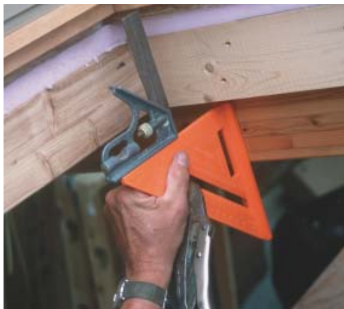
Figure 2. An improvised tool helps center the unit in the opening. The speed square rides along the rafter, and the combination square indicates the space between the unit and the rough opening. Note the layer of polystyrene insulation installed beneath the roof sheathing.

room in the summer. For that reason, I always steer clients toward a ventilating skylight — preferably manual rather than motorized. I feel more comfortable with the simplicity of the manual unit and like knowing I won't get a call in five years to repair or replace a motor. Plus, electronic units cost twice as much as manual units.