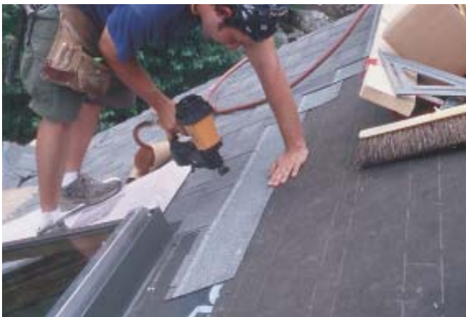
Figure 9. The leading edge of the head flashing (top left) gets covered with a second strip of eaves membrane (top right). Note that the felt is lifted so the membrane can be adhered to the roof deck. Notching the shingles around the skylights maintains a 4-inch exposure (above).

so they won't poke through the frame, and they're noncorrosive to the aluminum.