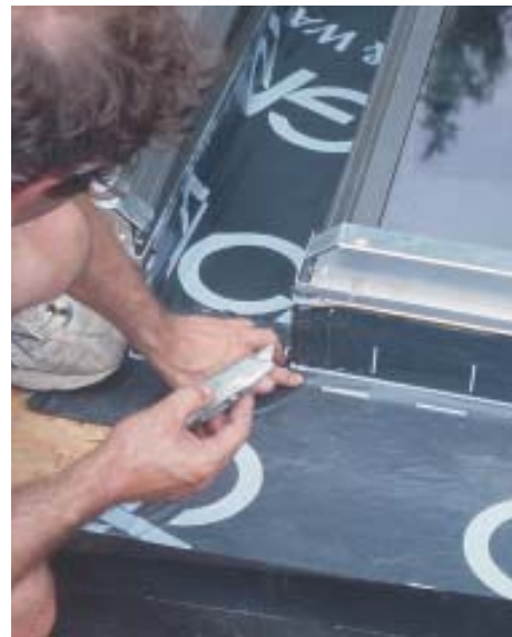
Figure 6. The top piece of membrane laps over the sides (left), and a slit cut outward forms a flap that folds around the corner (right). The membrane's leading edge is adhered to the roof deck under the felt.

hands on deck, we take positions at top, bottom, and middle and try to keep the membrane from sticking to itself and making a mess. The piece is cut so that it extends about 6 inches beyond the skylight, top and bottom. We adhere the membrane to one skylight and smooth it down toward the roof and back up onto the other skylight (Figure 5, previous page).