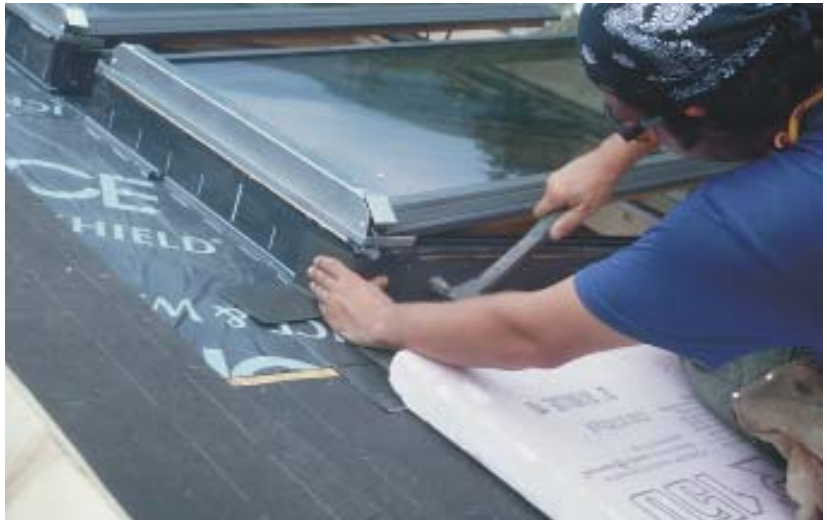
Figure 8. Cutting the last piece of step flashing at the fold allows it to be bent around the skylight's top and nailed like the others to the side of the frame.