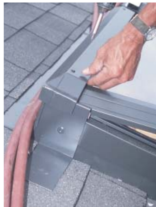
Figure 10. Reinstalling the skylight's cladding completes the process. The bottom goes on first (top left). Slots in the bottom receive the side pieces (top right). Plastic inserts in the sides receive the screws inserted through the head flashing (above left). Finally, the top cladding piece is slipped over the head flashing and secured with two screws (above right).