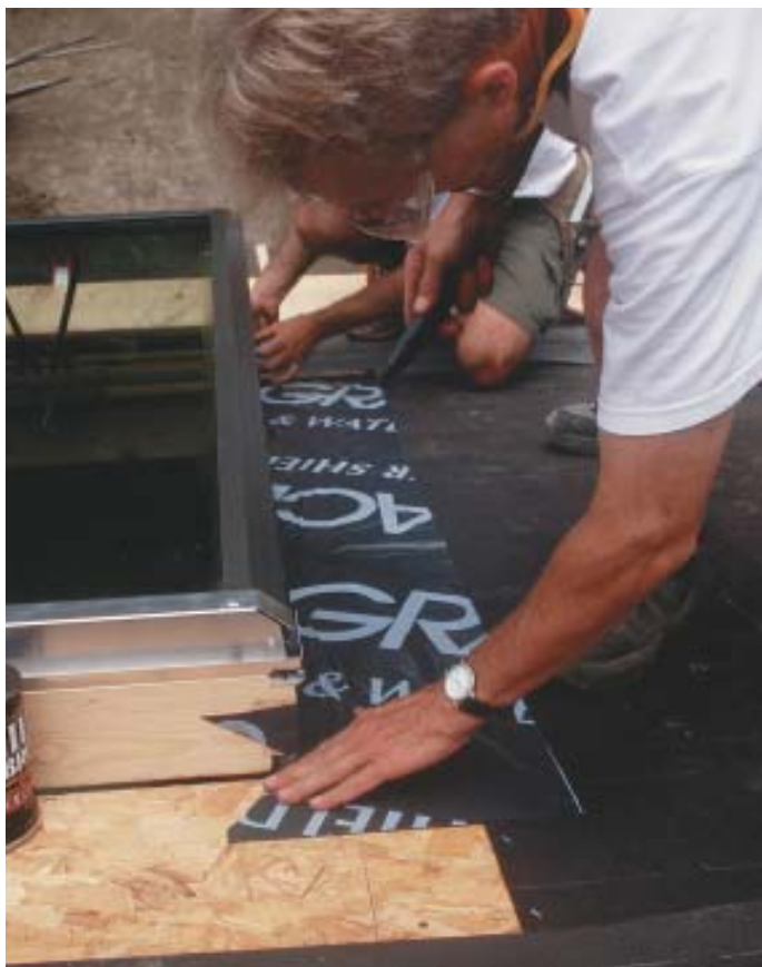
Figure 5. To reduce the chance of leaks, the author uses a single piece of membrane in the space between skylights. Folding the membrane in half helps to keep it from sticking to itself (top left). Aligning the membrane's edge on the first unit and smoothing toward the roof deck and back up the second unit minimizes wrinkles (top right). Cutting the corner allows the vertical leg to wrap around the top corner (above).

annular rings resist pull-out even if they're driven only into the roof sheathing. Next I reinstall the sash to check operation and ensure that the unit's frame is square and will remain so. Once the unit is in its final position and the sash operates without binding, we fasten through the other brackets, locking the skylight in place.