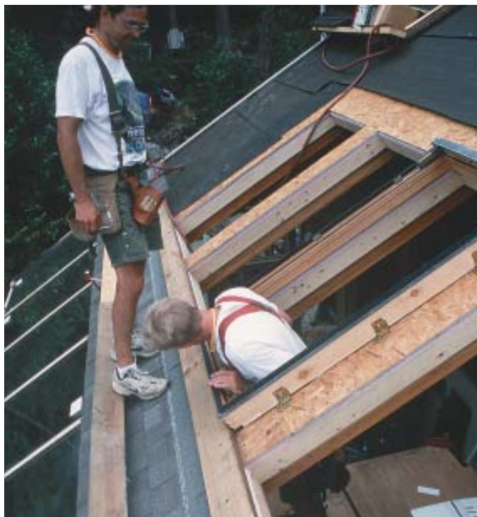
Figure 3. Tacking a 2x4 cleat to the sheathing keeps units in a straight line and prevents them from sliding off the roof. Once the units are secured, the cleat will be removed so shingling can continue.

When I'm certain the skylight is centered, we nail through the mounting brackets in two opposite corners, using the heavy-duty ring-shank nails included with the skylight (Figure 4). We try to get them into the roof framing, but the