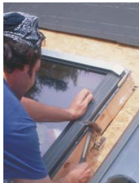
Figure 4. After the carpenters nail down two of the four mounting brackets, they reinstall the sash to make sure that the unit is square (left). Necessary adjustments are made; then the other brackets are nailed off (right).