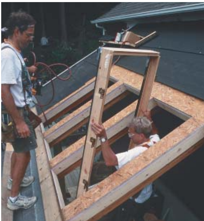
Figure 1. Removing the sash makes handling safer and easier. Narrow strips of ceiling between skylights make layout mistakes really obvious, so special attention is given to accurate spacing during framing.