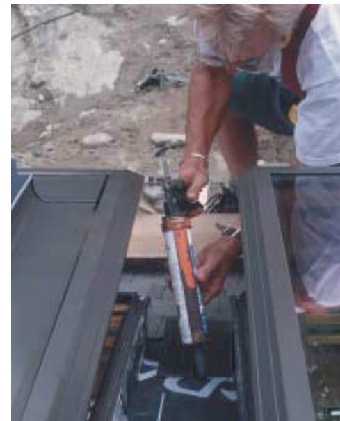
Figure 7. When the shingling reaches the skylight, the sill flashing is slid up from the bottom and fastened at the top corner with the manufacturer's special nails (left). The first piece of step flashing overlaps the sill flashing 3\frac{1}{2} inches. Where adjacent sill flashings overlap, urethane sealant provides extra insurance against leaks (right).