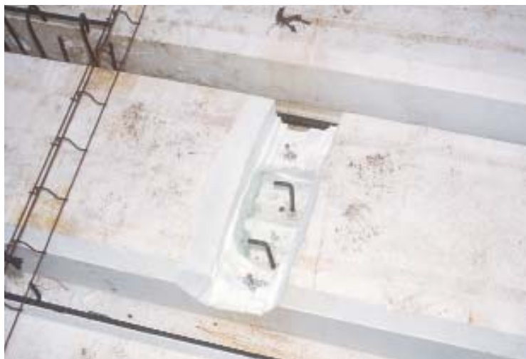
Figure 11. To provide for a chain fall or hoist, the author installed a pair of foundation anchor bolts through one of the floor forms. The bolts are set in a cavity scooped out of the deck form and tied to rebar extending back to two adjacent joists. The bolts will be used to attach a rugged bracket to the ceiling below.

My flatwork sub, Will Daniels, placed a 5,000-psi mix in a continuous pour to the prescribed 4-inch floor thickness over the forms. Will noted that the foam panels felt sturdier underfoot than any all-steel pan system he'd worked on. We were able to pull the mix truck up near the top of the wall and chute the mix around the floor. This was really convenient, because, ordinarily, the cellular configuration of the wall forms requires the mix to be pumped. The deck pan and the running gap around its edge enabled us to distribute the concrete to the perimeter without the added cost and hassle of pumping.