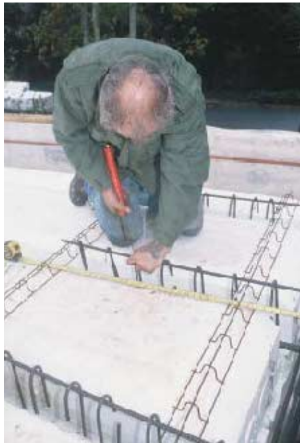
Figure 9. To eliminate a moment connection, steel rebar connecting the floor system to the walls was installed independent of the wall rebar, providing for possible movement in the floor to be released at the top of the wall (left). The right-angle connecting rods were tied to the #8 longitudinal rod with #2 rebar stirrups, placed 5 inches on-center over a 3-foot run (below).

Stress relief. I had planned to tie the horizontal rebar in the joist channels to the vertical rod in the wall forms. However, my engineer was concerned that that would create a moment connection that could transfer undesir-