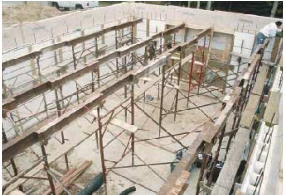
Figure 6. The deck pan was supported by a series of 4x6-foot steel frames and braces, topped by sectional steel I-beam strongbacks. The strongbacks were arranged in four parallel rows on nominal 7-foot centers.