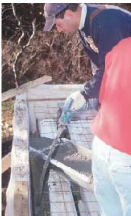
Figure 12. The pressure generated by vibrating and compacting the concrete began to force pieces of retrofitted foam blocking out of place, despite the use of foam adhesive. Backing off on the vibration averted a blowout.

The final cost of the slab was $16.60 per square foot, including steel, concrete, the forms, the falsework, and labor.