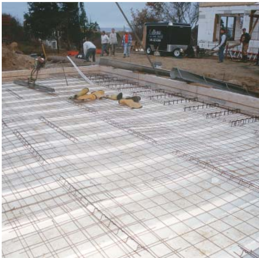
Figure 10. Welded 6-inch-square steel fabric was placed over wire chairs and wire-tied to the perimeter rebar to unify the floor system.

a rugged attachment point in the ceiling near the overhead door. I used standard, L-shaped foundation anchor bolts, punched through the bottom of the form inside a scooped-out access hole. I tied each bolt to a length of rebar that engaged an adjacent joist form (Figure 11). The access hole penetrated a utility chase, which I capped with expanding foam to keep out the concrete.