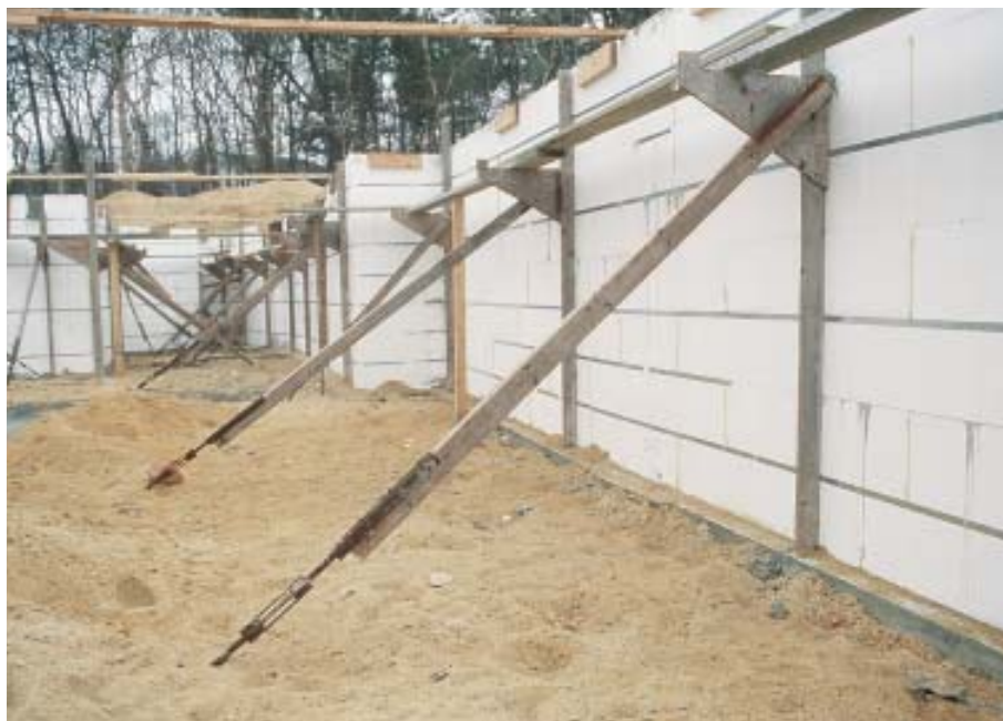
Figure 3. The author's site-made staging brackets provide lateral support to the ICF wall forms during the pour, as well as access to the top of the forms for pumping concrete and setting the anchor bolts and sill plate. Backers on the opposite side of the wall provide external bracing and catch the 16-inch-long screws used to attach the staging to the form work.