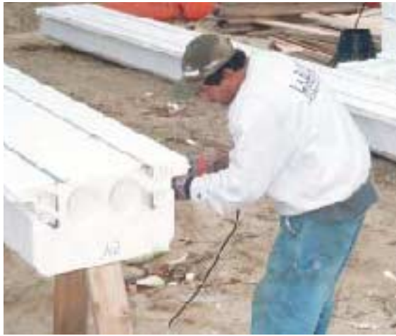
Figure 7. The 24-foot-long panels were shortened to bear only on the inner edge of the foundation forms. A recip saw was used to cut through the integral steel Z-beams. The entire 24x36-foot deck was covered within an hour.