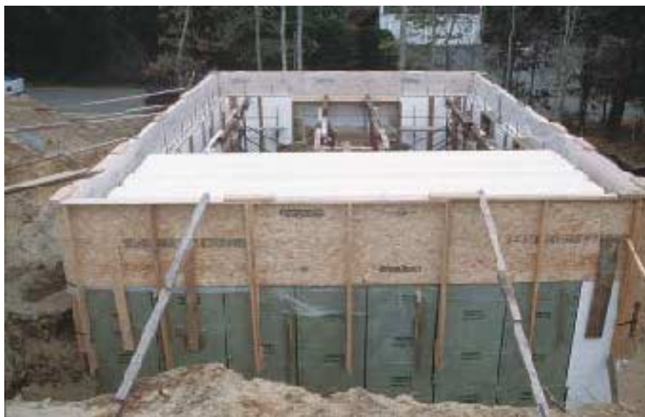
Figure 4. Perimeter forms were required to contain the edge of the poured floor system. Subfloor panels served temporary duty as form panels, attached in the same manner as the wall brackets, using 16-inch LogHog screws and 2x4 backers. Plywood scraps pack out the bottom of the vertical braces to hold the panels flush and parallel to the outside wall surface.

I buy by the case, to attach the brackets. We drive them through the narrow edge of the 2x4 bracket uprights, through the foam, and into the narrow edge of the backers. By aligning the brackets over the webs in the foam blocks, rather than through the cells, we're able to retrieve the screws for reuse. The best way we've found to drive the screws is with an electric impact wrench.