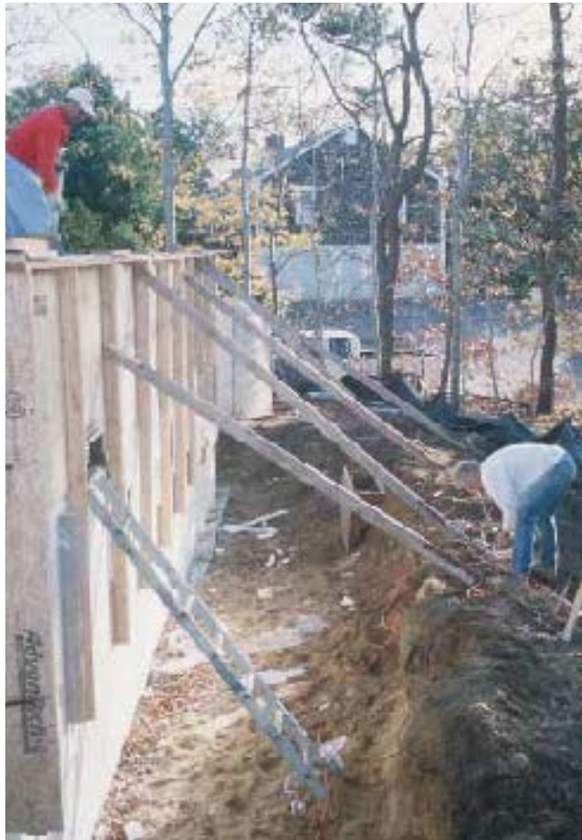
Figure 5. Excavation made it difficult to install counter bracing on the exterior side of the wall. However, it proved to be essential to countering the tendency of the perimeter forms to bulge outward during the pour. Screw-jack adjustments at the base of the braces pushed the forms back into position.

Drainage slope. We pitched the falsework to provide floor drainage toward the overhead door side by raising the opposite side 2 inches over the 24-foot-wide span. Not only is such drainage for a garage floor required by code, but given the building’s proximity to the ocean and salt spray, I wanted to make