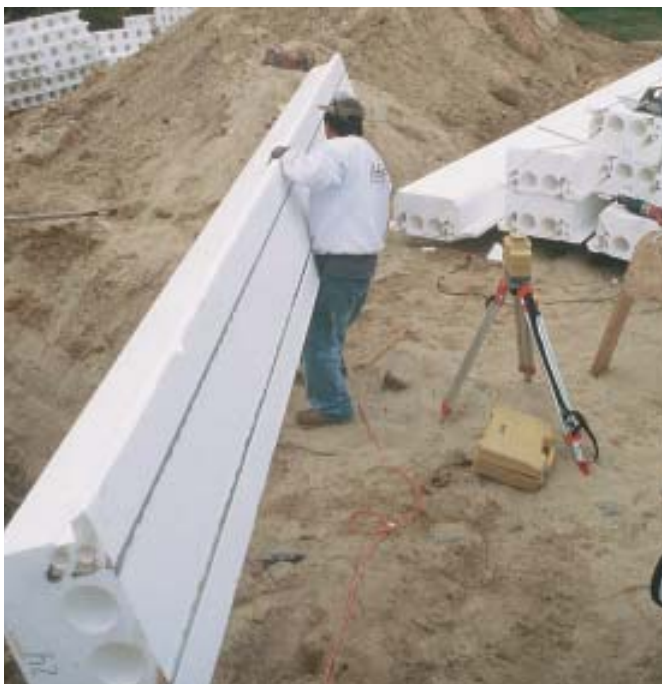
Figure 1. At roughly 2 pounds per linear foot, the interlocking deck panels can be carried and set in place by a single worker with relative ease.

Backers. Since you can't attach nails or screws directly to the foam, we use 2x4 backers on the opposite side of the wall forms. The backers also help to brace the wall form. We use 16-inch-long hex-head LogHog screws (Olympic Manufacturing Group, Agawam, Mass.; 800/633-3800, www.olyfast.com ), which