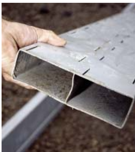
Figure 4. A circular saw equipped with a cutoff blade produces a fast, clean cut (left). Lengths of Form-A-Drain are divided into two chambers (above); this adds rigidity, and is useful for radon control applications in which the upper chamber is connected to a vent system powered by an in-line fan.