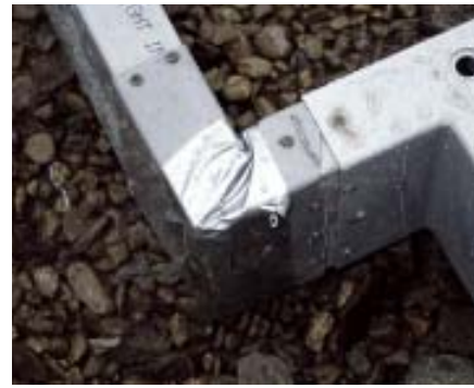
Figure 7. Where this footing transitioned from 16 to 24 inches (left), there wasn't enough room for two corners. A shortened corner patched with duct tape solved the problem (above).