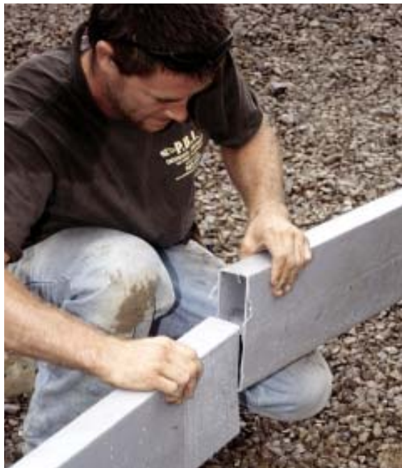
Figure 3. Lengths of Form-A-Drain are joined with slip couplings and drywall screws.

We then make up two corner assemblies, each consisting of a length of Form-A-Drain attached to a corner piece. We make up one for the inside and one for the outside, making sure the drainage perforations are facing out. The corner pieces have knockout holes that