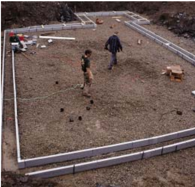
Figure 11. The foundation shown in this article measures 44 by 30 feet, and has 11 corners and a three-sided bump-out. Form-A-Drain installation took a three-man crew about three hours and cost around $450 in materials.

forms above it. (For example, for a 12-inch-high footing, you could dig a 4-inch trench and put the 8-inch Form-A-Drain on top.) The second option is to leave a 4-inch space between the bottom of the Form-A-Drain and grade, and fill the void with dirt or gravel.