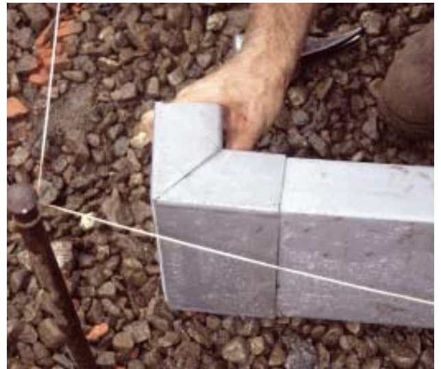
Figure 6. A worker makes a corner from coupling stock by carefully taking two 45-degree passes with a circular saw to remove a 90-degree wedge from one side.

in case we need to tap down a high spot when we're leveling everything.