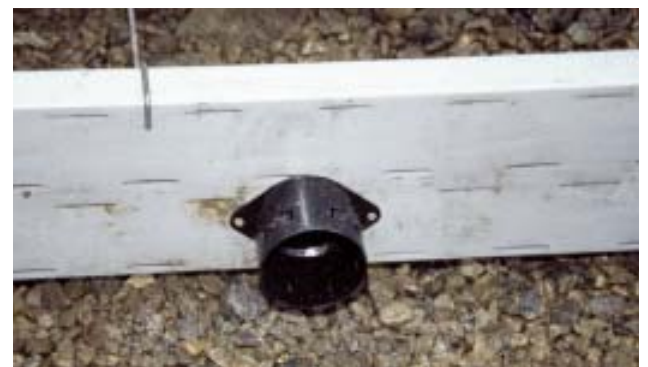
Figure 9. Using a hole saw (top left), a worker drills a 3 1/2-inch hole in the side of the form for the crossover pipe (top right), which allows the inner form to drain into the outer form. The pipe adapter attached to the outside form (above) will connect to the daylight drain.

to help hold them in place, then bring in the excavator to spread the rest of the stone while we're setting the foundation forms.