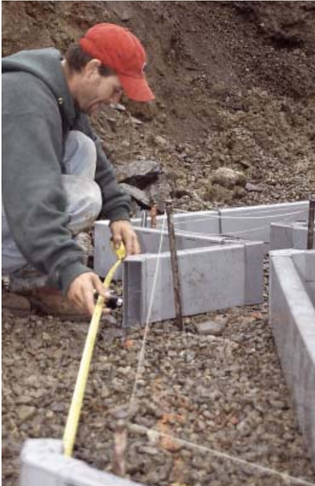
Figure 8. The crew saved this 45-degree bump-out for last. The angles are fairly easy to form because the slip-on fittings provide 2 inches of leeway.

metal stakes in 18- and 30-inch lengths and suggests using one every 3 to 5 feet. You also can use wood stakes or regular form pins, but the CertainTeed stakes are inexpensive so it's no big deal to leave them in the ground. We secure the forms to the stakes with screws.