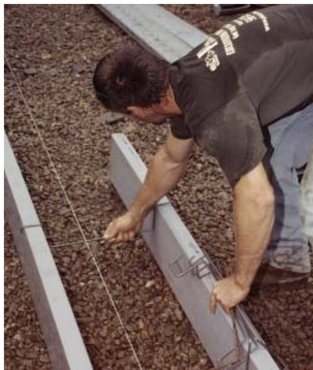
Figure 5. Once one side of the form is positioned, spacer straps automatically locate the opposite side (above). Pieces of strapping secured with drywall screws (right) are a good solution when you don't have the right size, or for nonstandard footing widths.

allow us to slip the assemblies over the pins (Figure 2, previous page). This holds the corners in place while we're getting started.