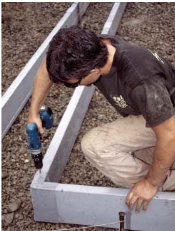
Figure 1. A worker secures a preformed corner with drywall screws (right). Preformed 45-degree bends are also available (below). Vertical 90s and tees are handy for stepped footings (bottom).