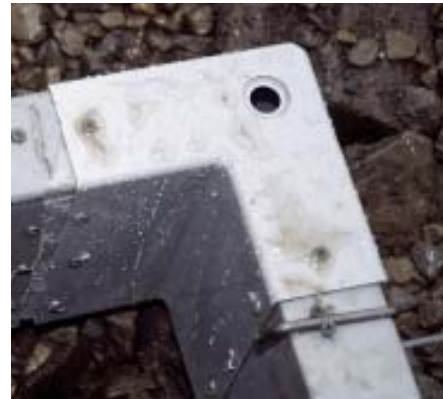
Figure 2. The author determines the footing location by measuring from a string representing the outside of the foundation wall (left). At footing corners, short rebar pins driven into the ground hold corner forms in place. A knockout hole in the bottom of the corner (above) receives the pin.