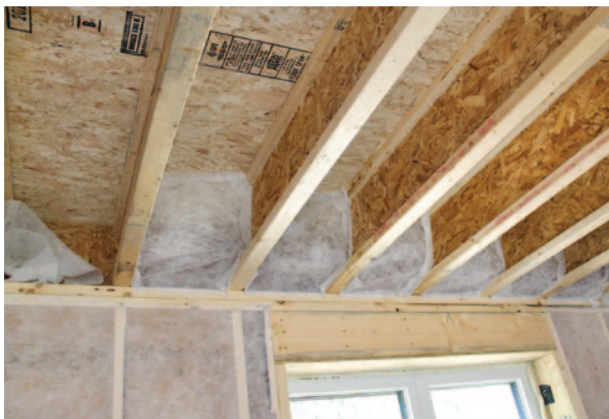
Figure 7. A strip of netting between a top-plate nailer and the facing joist makes it possible to dense-pack this area of the band joist (top). Netting stapled between the joist ends is filled with cellulose to form insulating and air-sealing "pillows" (above).

the joists, but before we blow the cavities. That restrains the cellulose and ensures that any bulges that do form won't push out against the drywall.