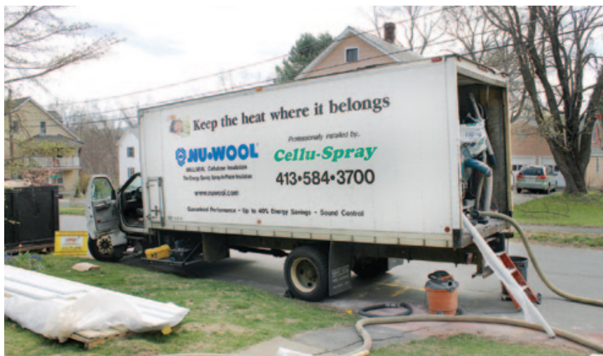
Figure 1. This truck (above) is equipped to install either damp-spray or dense-pack cellulose. The hopper that feeds material to the operator can be filled to the ceiling (right), providing enough material to last from 15 minutes to an hour, depending on the application.

While loose-fill has an R-value of about 3.5 per inch, it has less air-sealing ability than dense-pack does. A common mistake in retrofit applications is to blow cellulose directly onto a ceiling that's riddled with existing air leaks; afterward, it's very unlikely that anyone will go to the effort of finding and sealing those leaks. In retrofit applications, we make sure to air-seal the thermal envelope at the attic floor before applying more insulation. We look for any penetrations like chimneys, bath fans, and vent pipes, as well as interior parti-