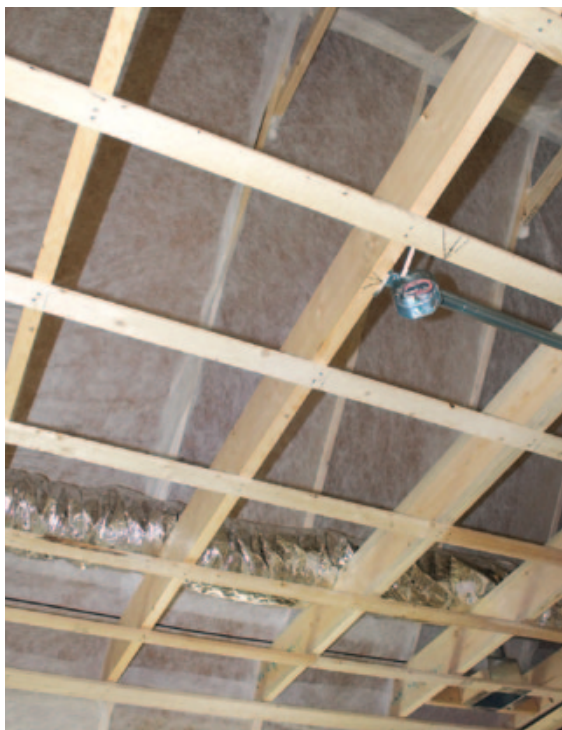
Figure 3. A skilled installer can snugly fit the netting around joists, collar ties, and other obstructions. As long as the material is tight and securely stapled, small gaps won't leak significant amounts of insulation as the cavities are blown full (right). In complex areas, like the peak of this Queen Anne tower (below), netted dense-pack can be a cost-effective alternative to spray foam.

In new construction and gut retrofits, our preferred approach is to fasten netting over the entire frame and blow the cellulose behind the netting. Like damp-spray, this offers complete quality control, since the packed material can easily be seen and felt after installation. The permeable netting gives the air in the cavities an easy route of escape, making it possible to fill the cavities quickly.