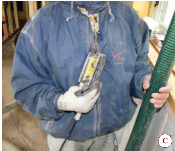
Figure 4. Wall cavities are filled first from the bottom to the midpoint of the wall (A), then from the top back to the middle (B). After a cavity is filled, the operator uses a remote control (C) to momentarily turn off the blower, then quickly inserts the hose into the next cavity before switching it on again.