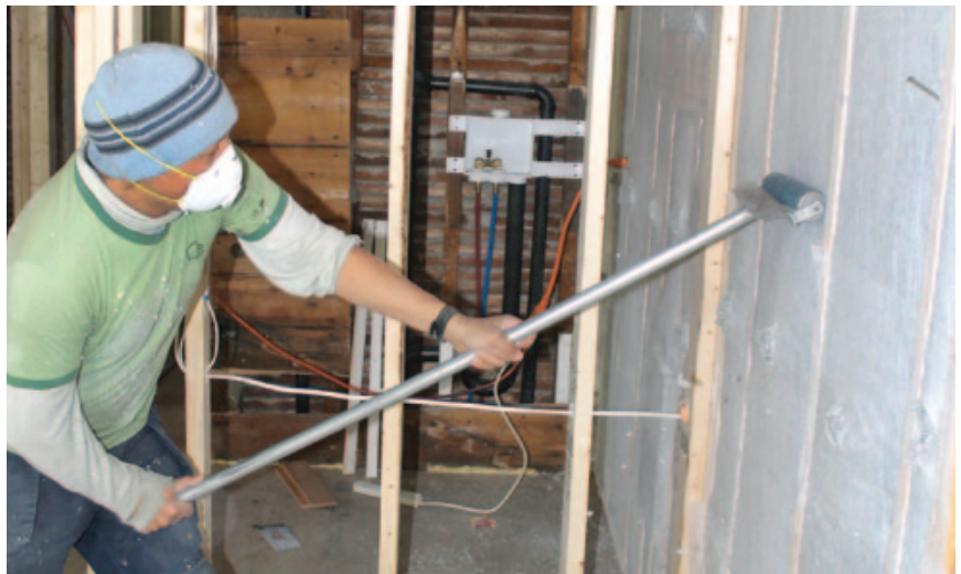
Figure 5. Filled cavities are compacted with an aluminum roller to avoid bulging drywall. A quick pass of the hand is enough to confirm that the insulation lies flush with the framing.