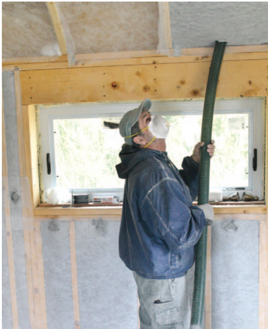
Figure 6. When filling rafter cavities, the usual insertion point is just above the top plate (above). The natural curvature of the longer hose required tends to direct the flow of insulation to one side of the cavity, so filling it uniformly requires a second pass with the curve facing the other way. The hose is visible behind the netting in the photo at right.