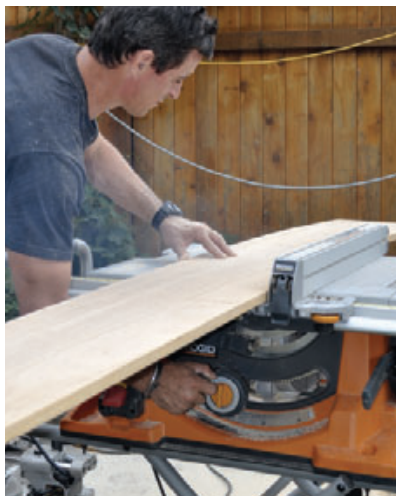
Figure 2. Locate the side piece of the workstation on the tablesaw and crank up the blade to cut the notches.