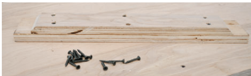
Figure 3. The foot-skid assembly supports the saw at the same height as the table top, as well as making it easy to place the saw in the workstation and remove it again.

workstation brings us to the moment of infeed-outfeed truth. Success means the saw is dead flush with or just below the top of the box. You may need to add thin shims or plane down the feet slightly to make the fit perfect.