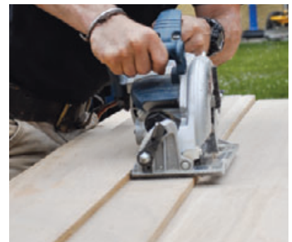
Figure 1. Make a shooting board by screwing one piece of plywood (with a factory edge) atop another that's wider than the base of your circular saw. The first cut trims the bottom plywood to the exact saw width, making a zero-clearance guide that guarantees straight, splinter-free rips.

I run 2-inch drywall screws through the side pieces into the end pieces, aligning them with a square as I fasten them together. I screw the rib into the center of