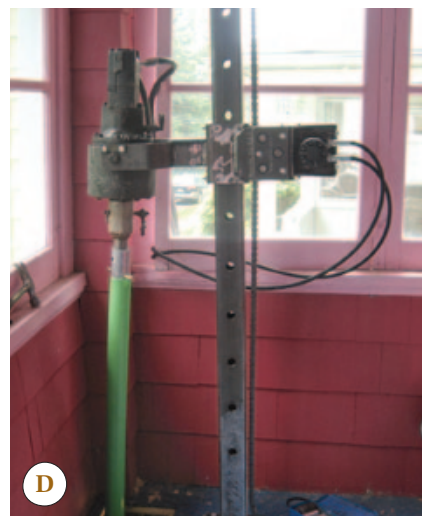
Figure 6. The author's small rig excels at going places larger pile-driving equipment can't (A, B, C). When the machine won't fit into a tight area, the drive head can be mounted on a portable bracket that bolts to the structure (D).

be needed. But when helical piers are included in the foundation design, you can usually eliminate extra excavation and concrete. In such cases, the foundation is typically excavated to standard depth, and then we install helical piers in the centerline of the footing form at specified intervals down to good soil or bedrock. Before the concrete is placed, the pier caps are tied into the rebar of the traditional footing.