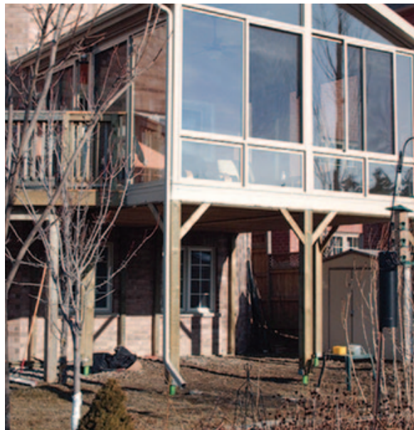
Figure 4. Above is a typical deck foundation using helical piers, which have greater bearing capacity than concrete piers and install with little disturbance to the landscape. At right, treated posts supporting a porch have been fastened to connector caps on the helical piers.