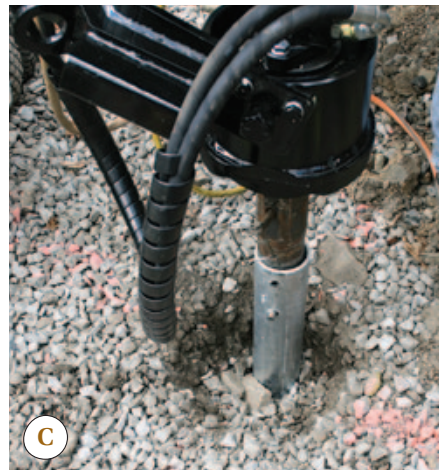
Figure 3. Shaft extensions are welded on and the pier driven as deep as needed to reach soil with adequate bearing capacity (A). The pier can be steered around a below-grade rock by moving the driver's boom; once the obstruction is passed, the boom pulls the shaft plumb again (B). Even though this pier penetrates about 13 feet into the ground, there's no pile of excavated soil as there would be with a conventional footing (C).

down to virgin ground at the house foundation level — as much as 7 feet or 8 feet if the house had a basement. It's far easier to drive a helical pier to this depth.