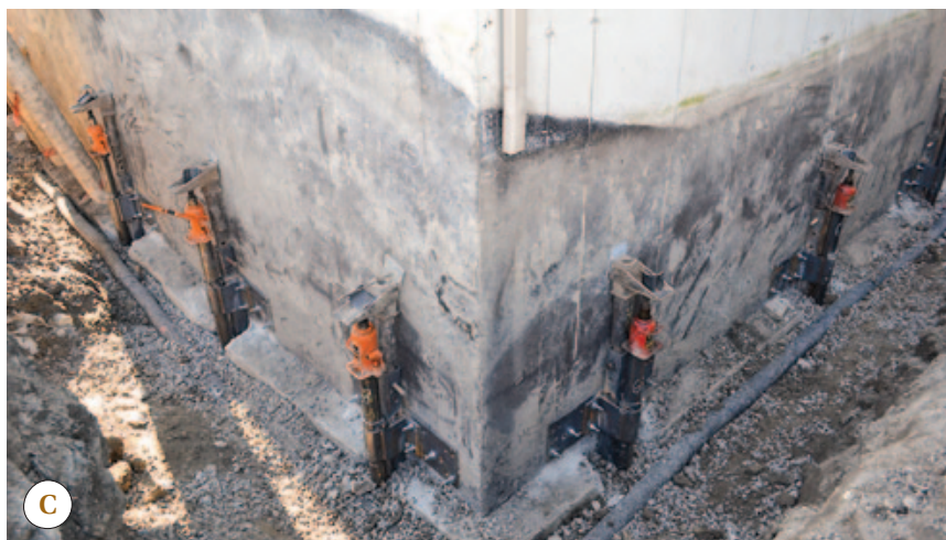
Figure 5. Adding a vertical extension to the drilling rig makes it possible to drive piers into steeply sloped sites (A). The machine is also well-suited to foundation stabilization work, as it can fit in tight spaces around existing homes (B). Piers are typically installed every 6 feet along an underpinned foundation (C).

results for each pier in a field report. If required, a Techno Post engineer will then stamp the field report and send it directly to the building department. (Some departments don't require a stamp. Your local pier installer will know the acceptable way to proceed.) The cost of this engineering is built into the cost of every helical pier we install, though different pier manufacturers may charge separately for an engineering report.