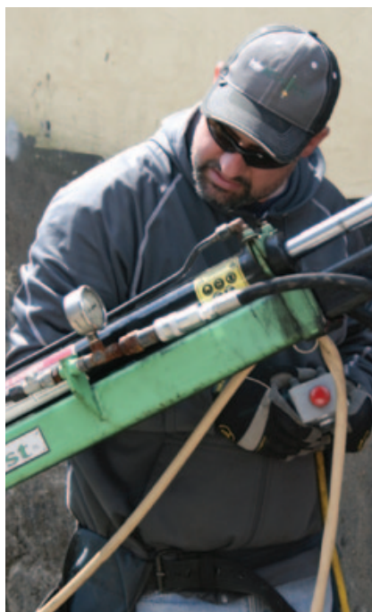
Figure 2. A pier's bearing capacity usually relates to the torque required to drive it. A gauge on the machine measures the hydraulic pressure, which correlates to the torque.

machine that's small enough to fit through a gate and go places larger machines can't. I can actually drive the rig right onto an existing deck if I need to retrofit additional footings to support a new hot tub.