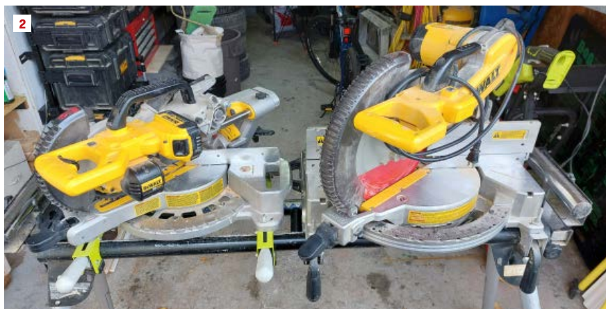
The DeWalt DCS361M1, with its open side grips and a top handle, is easy to move around a jobsite (1). Note the difference between the 7 1/4- and 12-inch saws (2). Not every job needs the biggest tool.