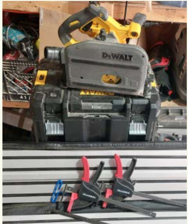
The DCS520ST1 with all its accessories was a financial stretch for the author, but it facilitated one project and led to success on many others.

Then a job came along to renovate a restaurant. I would be building shelving, a bar, booths, and more, all on site, with a lot of finish-grade plywood. Most of this work I would be doing alone so being able to create all of it safely, clean, and accurately was vital. The search for the sale began, and I am happy to report that